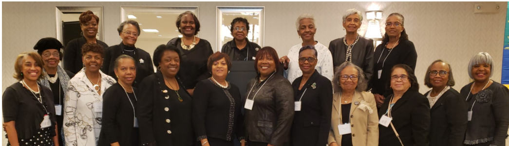
A.M.E. Zion Attendees on Thursday