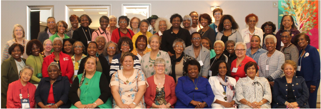
Attendees at North America Seminar